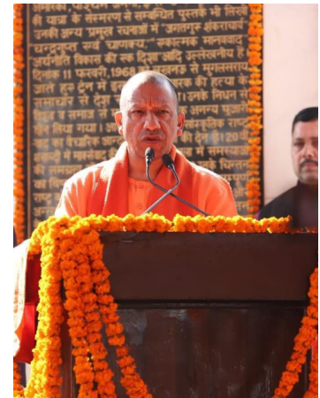
CM Yogi exposes the opposition's negative politics on development initiatives