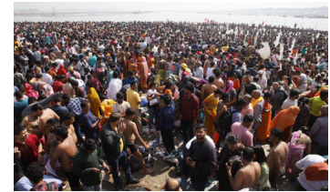
Mahakumbh unites all: Devotees from every walk of life join in sacred bath