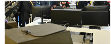
AeroIndia 2025: Strengthening the Army Air Defence with Indigenous Solutions